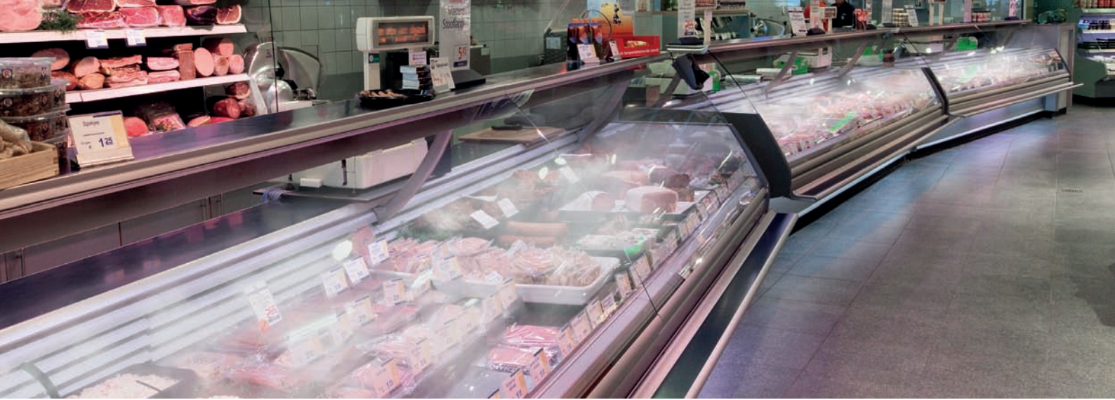
Laureijs butcher shop, Veldhoven