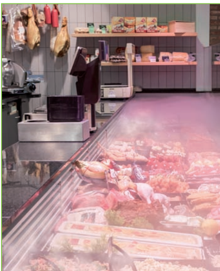
Johan Jansen butcher shop, Gemert